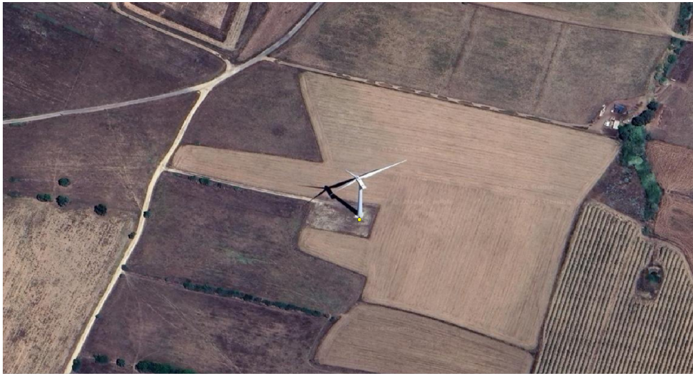
Figure 1: Overview on how a wind turbine looks from Google Satellite pictures at a 1:1,000 resolution.

milvus ) [22] , a small reintroduced population of Bonelli's eagle ( Aquila fasciata ) [23] and the endemic Corsican finch ( Carduelis corsicana ).