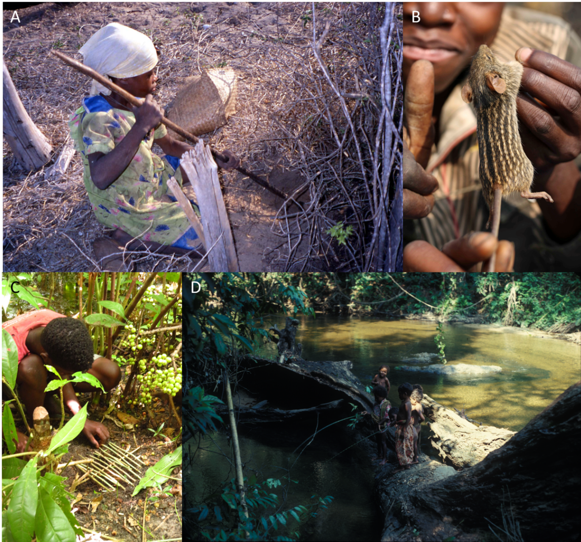
Caption Figure 1: A - Mikea child in Madagascar digging for tubers. Courtesy of Bram Tucker. B - Striped grass mouse or zebra mouse ( Lemniscomys striatus ) hunted by Bateke children in the forest-savannah edge using small nets set up on the ground, in Bolobo territory, Mai Ndombe province, Western DRC. Courtesy of Romain Duda. C - Building traps for blue duikers ( Philantomba monticola pembae ) in Pemba, Zanzibar. Ilaria Pretelli. D - Malaysian Batek children line-fishing. Courtesy of Kirk Endicott and Vivek Venkataraman.