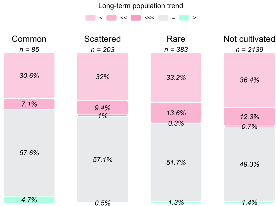
Figure 2: Positive effects of cultivation on long-term population trends. Proportions of long-term population trends (50 - 150 years) per cultivation frequency, accompanied by respective sample sizes (n) Population trends are as follows: “<” indicates moderate decline, “<<” indicates strong decline, “<<<” indicates very strong declines, “=” indicates stability, “>” indicates significant increase.

To test this hypothesis, I examined if cultivation frequency affects species' long-term population trends. Cultivated species tended to show lower instances of declines when all decline categories (moderate, strong, very strong) were combined than not cultivated species (common = 0.376; scattered = 0.424; rare = 0.47 vs. 0.494 for not cultivated species; Figure 2). This trend was statistically clear for commonly cultivated species (p = 0.036). The differences in decline probability between scattered and rarely cultivated species compared to not cultivated species were statistically marginally clear (p-value = 0.067) and uncertain (p-value = 0.406), respectively. Commonly cultivated species displayed the highest probability of stable (0.576) and positive (0.047) long-term population trends, compared to 0.493 and 0.014 probability for non-cultivated species, respectively. This difference was statistically clear for positive population trends (p-value = 0.035), but not for stable population trends (p-value = 0.153). Together, there is a trend for cultivated species to have