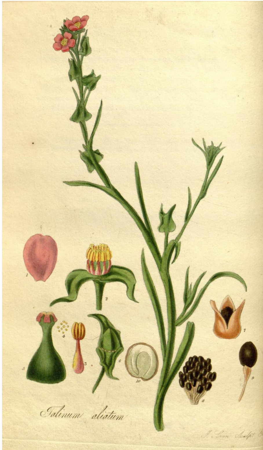
Fig. 1. Epitype of Calandrinia pilosiuscula DC. From Hooker (1824: 82).