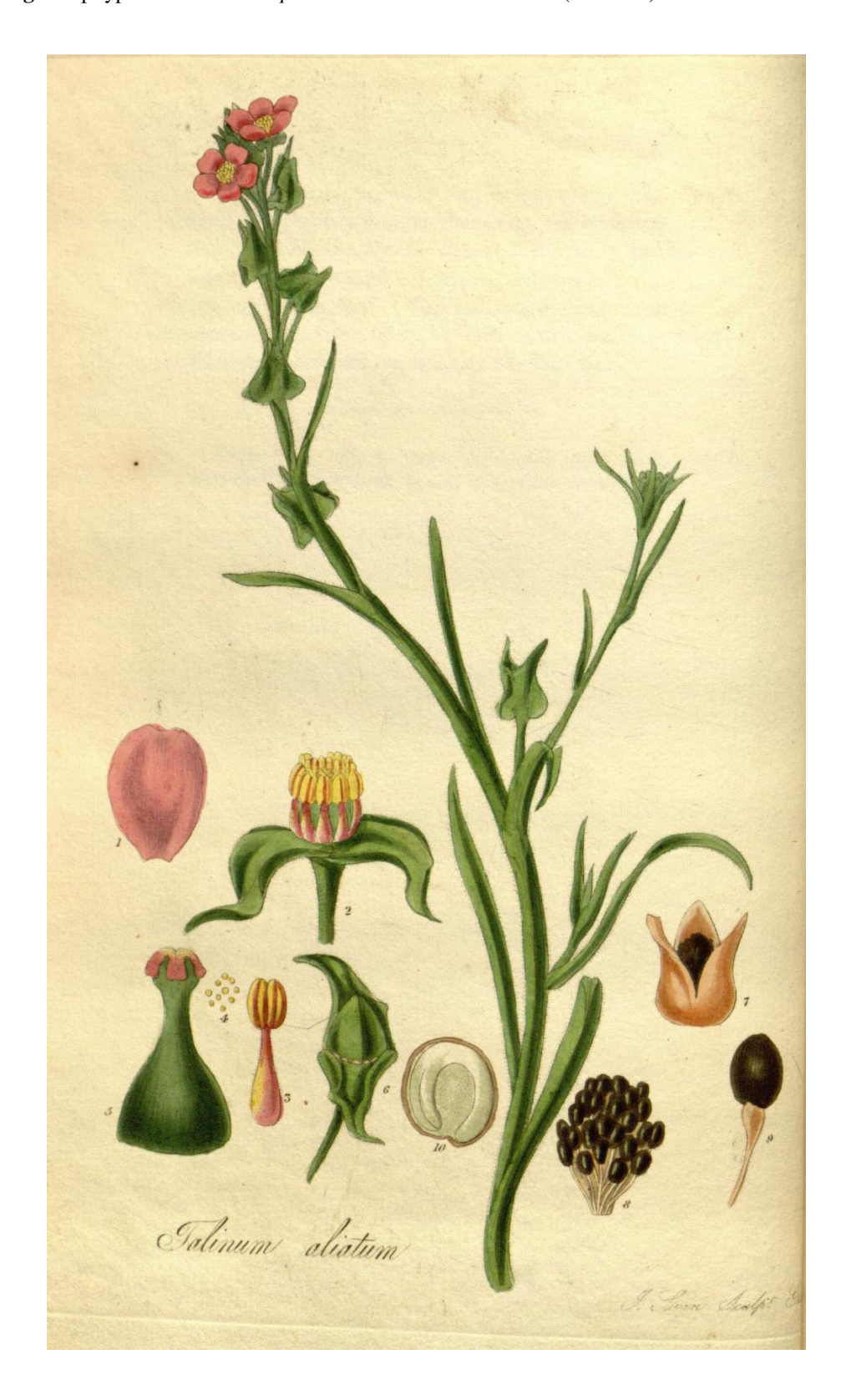
Fig. 1. Epitype of Calandrinia pilosiuscula DC. From Hooker (1824: 82).