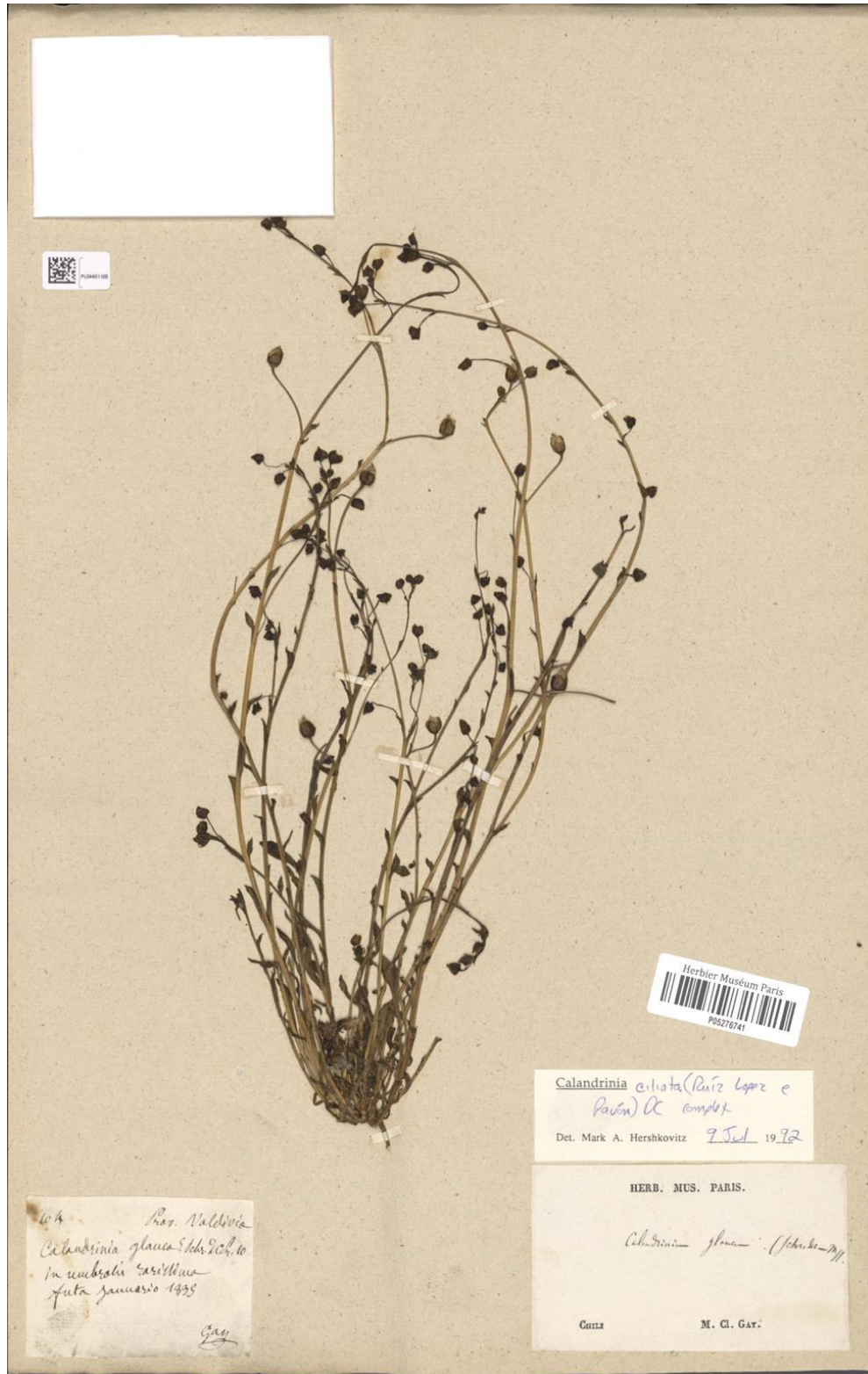
Fig. 1. Holotype of Calandrinia jompomae [C. Gay 104 (P [P05276741]). http://coldb.mnhn.fr/catalognumber/mnhn/p/p05276741