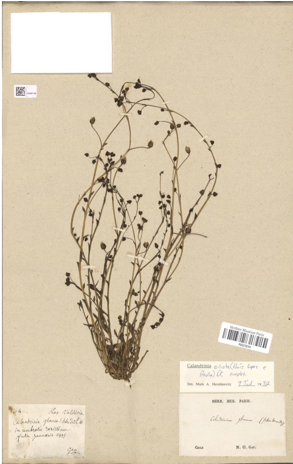
Fig. 1. Holotype of Calandrinia jompomae [C. Gay 104 (P [P05276741]). http://coldb.mnhn.fr/catalognumber/mnhn/p/p05276741