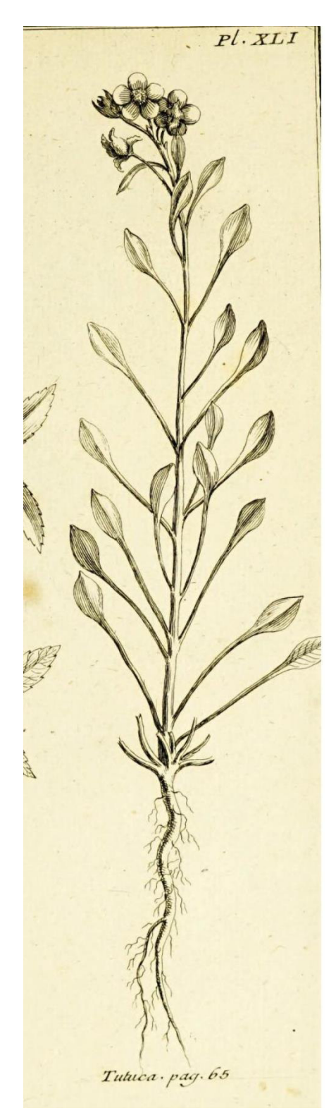
Fig. 7. "Tutuca Feuillée," illustration from Feuillée (1725).