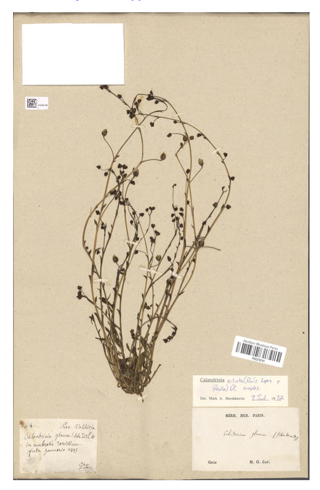
Fig. 1. Holotype of Calandrinia jompomae [C. Gay 104 (P [P05276741]). http://coldb.mnhn.fr/catalognumber/mnhn/p/p05276741