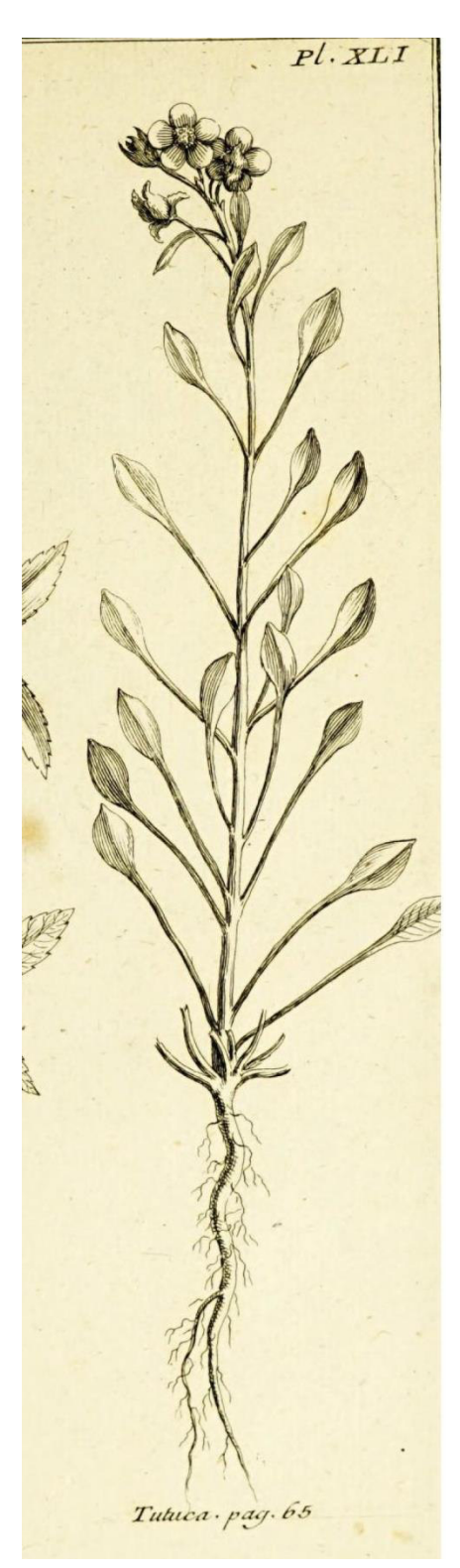
Fig. 7. " Tutuca Feuillée," illustration from Feuillée (1725).