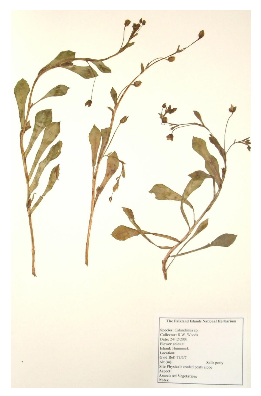
Fig. 6 . Calandrinia sp. UNITED KINGDOM: Falkland Islands, Hummock Island, 24 Dec 2001, R. W. Woods, s. n. (FINH).