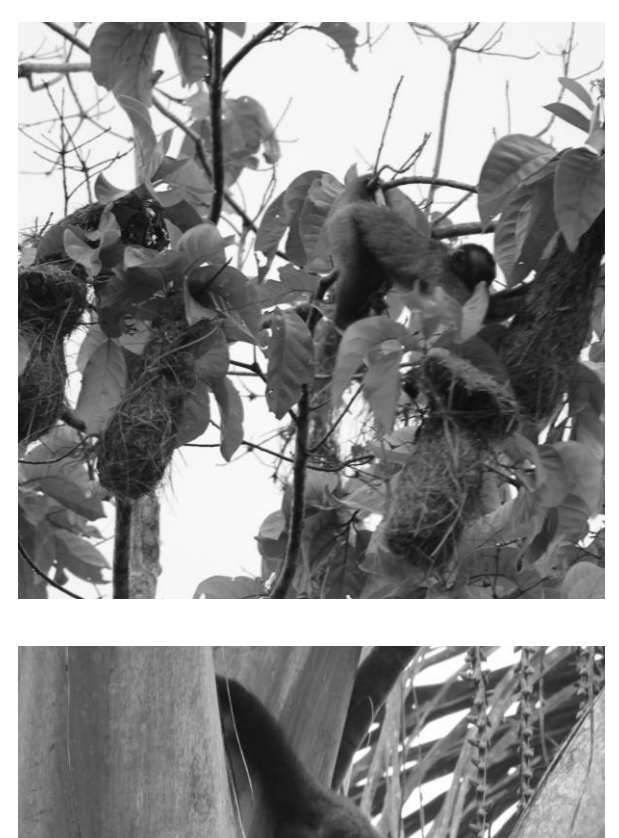
Figure 1. Sapajus apella individual inspecting the oropendola nests in the canopy.