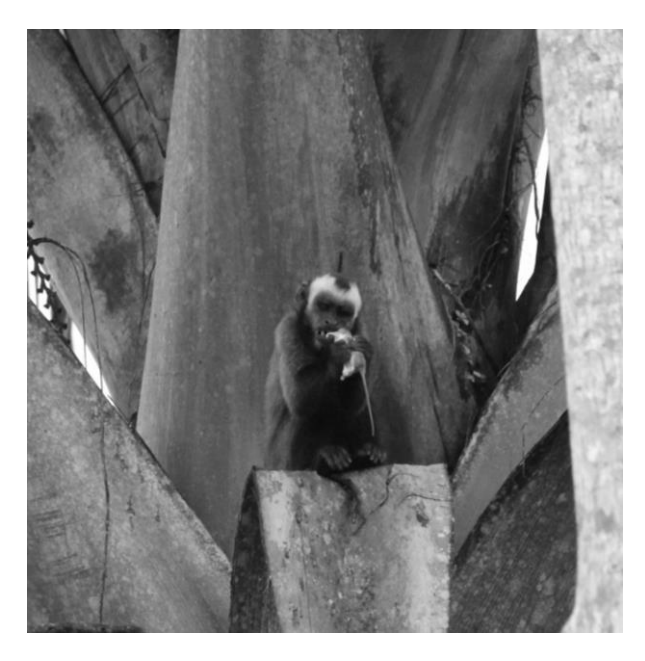
Figure 3. Sapajus apella individual feeding on the Oecomys sp. by consuming its head first.