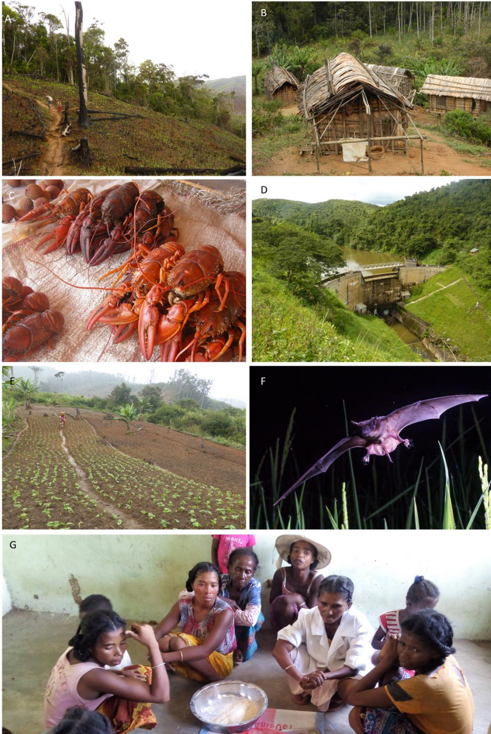
Figure 1. A) Tavy on the edge of Zahamena National Park. B) and C) Malagasy people have always used products collected from the forest (including building and roofing materials and food such as freshwater crayfish). D) Payment for Ecosystem Services Schemes, where users of hydro-electricity or operators of dams pay upstream farmers to maintain forest and reduce siltation, may contribute in future to funding forest conservation in Madagascar. E) Micro-development interventions such as improved bean cultivation can be popular and bring benefits but have tended not to result in significant transformation of farming systems. F) Functioning ecosystems can provide benefits; Mormopterus jugularis , Peter's Wrinkle-lipped Bat, predated pests of rice fields. G) Communities in the west of Madagascar are exploring the potential of working with international cosmetic companies interested in baobab fruits; a potentially high-value product allowing them to benefit from the endemic trees.