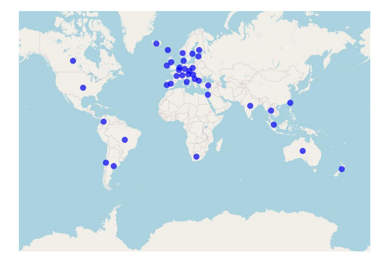
Figure 1 . World map illustrating the self-reported affiliations of all 430 participants recorded in a questionnaire about animal personality terminology. Map generated using EviAtlas (Haddaway et al., 2019).