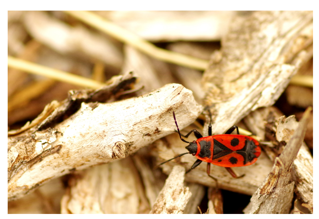
Figure 1. The European firebug Pyrrhocoris apterus, as discovered by a citizen scientist crawling through the mulch in Westgate Park (Melbourne, Victoria, Australia).