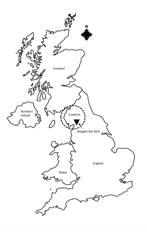
Figure 1 – The study area situated within the county of Cumbria (circled in blue), in the Northwest of England (Mapsoftheworld 2019).

Woodland cover within the NCA is, at 1.5 %, one of the lowest levels found in England and the lowest in Cumbria. Moreover, and importantly within the Natural England NCA profile report (Natural England 2010), the opportunity for woodland expansion is proposed in the form of the Statement of Environmental Opportunity (SEO) as an appropriate and desirable land-use for some areas within the NCA. Within the NCA there has been, for the past 10 years, a large amount of tree planting carried out as part of national agricultural and environmental stewardship schemes (Leeson, P. 2015, personal communication).