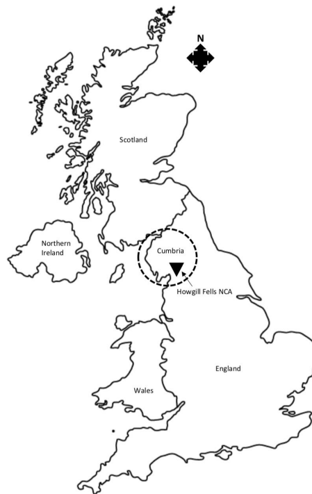
Figure 1 – The study area situated within the county of Cumbria (circled in blue), in the Northwest of England (Mapsoftheworld 2019).

Woodland cover within the NCA is, at 1.5 %, one of the lowest levels found in England and the lowest in Cumbria. Moreover, and importantly within the Natural England NCA profile report (Natural England 2010), the opportunity for woodland expansion is proposed in the form of the Statement of Environmental Opportunity (SEO) as an appropriate and desirable land-use for some areas within the NCA. Within the NCA there has been, for the past 10 years, a large amount of tree planting carried out as part of national agricultural and environmental stewardship schemes (Leeson, P. 2015, personal communication).