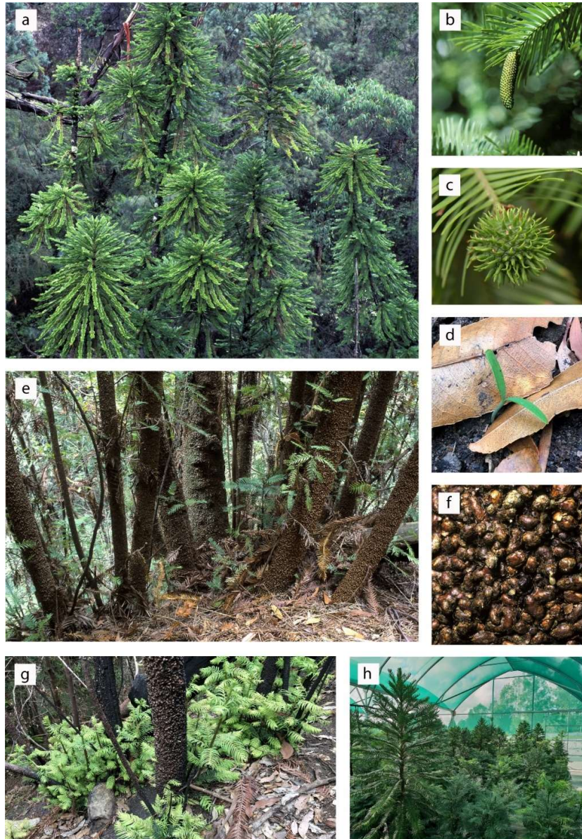
Figure 2. Selected life history attributes of Wollemia nobilis (Wollemi Pine). a) Mature Wollemi Pine in situ 1 ; b) male pollen cone (strobilus) 1 ; c) female seed cone (strobilus) 1 ; d) newly emerged seedling bearing two distinctive cotyledons 2 ; e) characteristic multi-stemmed habit 1 ; f) bark detail 1 ; g) prolific basal resprouting (coppicing) of a mature tree in response to the 2019–2020 bushfires 2 ; h) the ex situ living collection at the Australian Botanic Garden, Mount Annan 3 .