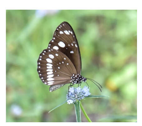
Figure I. A butterfly ( Euploea corinna ) using its long-proboscis to access nectar of an angiosperm flower ( Spermacoce sp.).

Clearly, insects that visited gymnospermous plants had accrued morphological diversity before the initial Cretaceous diversification of angiosperms. Studies of the fossil record have shown there is a plateau of insect family richness throughout the Cretaceous [44–46]; instead, insects accumulated a large proportion of family-level diversity early on in their history, by the Permian, with diversity later peaking in the Early Cretaceous [45,46]. However, this Early Cretaceous peak was likely caused by the evolution of parasitic insects and potentially morphological adaptations associated with pollination of gymnosperms [46]. Similarly, fossil and molecular analyses have revealed that insect families did not experience an increase in diversification rates during the Cretaceous [47]. Overall, these studies show that the diversification of insects, at the family level, was limited throughout the Cretaceous. This opposes the idea of a Cretaceous Terrestrial Revolution where insects rapidly codiversified with angiosperms.