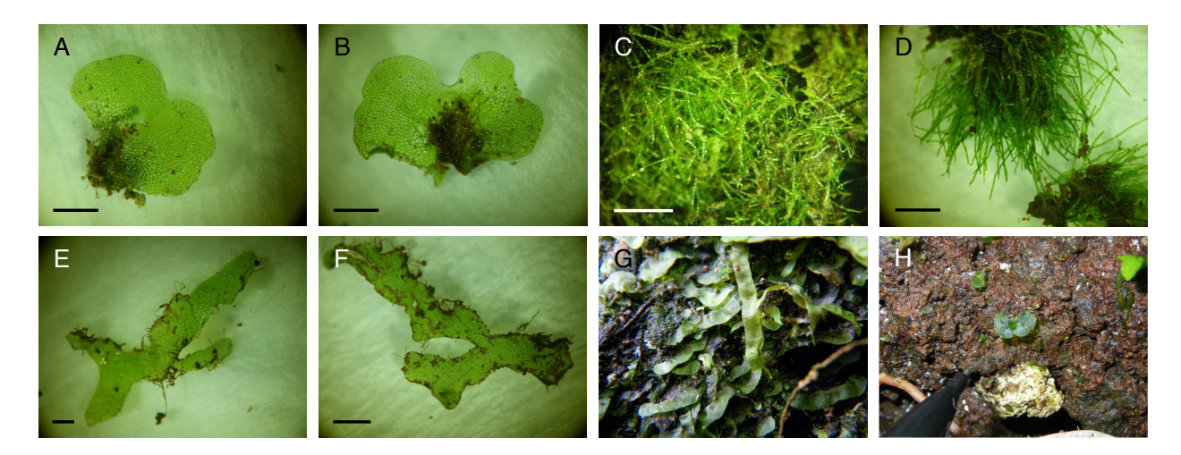
FIGURE 1. Examples of fern gametophytes identified using DNA barcoding (Nitta et al., 2017). (A–F) Pairs of species with similar morphology that could not be distinguished without molecular data. (G, H) Images of gametophytes in the field. In (A–F), morphotype provides a hint to taxonomy but cannot be reliably used for species identification: the cordate (heart-shaped) morphotype (A, B, H) is the most common, especially in terrestrial species; the filamentous morphotype (C, D) is restricted to Hymenophyllaceae and Schizaeaceae; the ribbon morphotype (E–G) typically occurs in Hymenophyllaceae, Vittarioideae, and several lineages of polypod ferns. (A) Sphaeropteris medullaris (G. Forst.) Bernh., Nitta 3454 (GH). (B) Austroblechnum raiateense (J.W.Moore) Gasper & V.A.O.Dittrich, Nitta 3637 (GH). (C) Crepidomanes minutum (Blume) K.Iwats., Nitta 3938 (GH). (D) Abrodictyum dentatum (Bosch) Ebihara & K.Iwats., Nitta 3487 (GH). (E) Callistopteris apiifolia (C. Presl) Copel., Nitta 3450 (GH). (F) Hymenophyllum polyanthos (Sw.) Sw., Nitta 3460 (GH). (G) Arthropteris palisotii (Desv.) Alston, Nitta 1104 (GH). (H) Ptisana salicina (Sm.) Murdock, Nitta 3507 (GH). Herbarium codes follow Thiers (2021). For (A–F), scale bars all 1 mm; photos taken under a dissecting microscope.