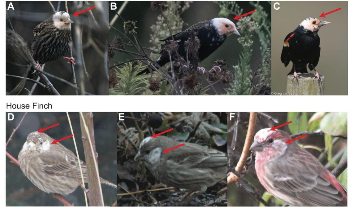
FIGURE 2. Examples of similar patterns of partial leucism present in different (A-C) Red-winged Blackbirds and (D-F) House Finches ( Haemorhous mexicanus ).