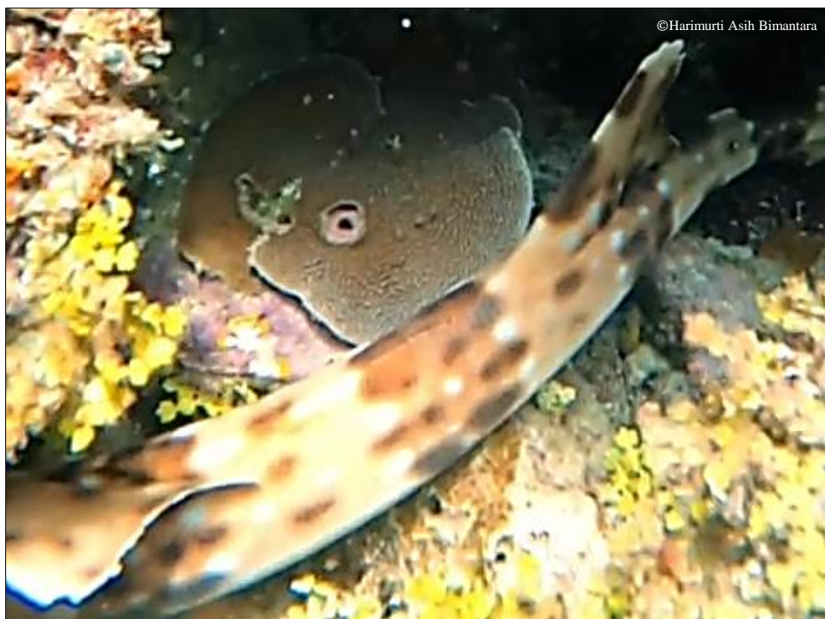
Figure 3. The head part image of H. halmahera