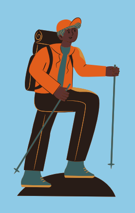
SCIENCE EDUCATION DIRECTOR