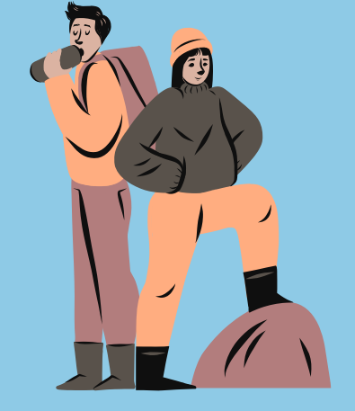
FIELD STATION MANAGER