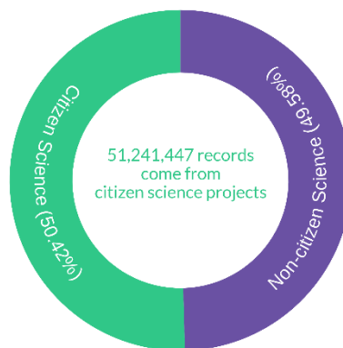
Figure 1. Proportion of (a) research or monitoring projects that provide data to the ALA that use citizen science or not, and (b) the proportion of species occurrence records derived from citizen science or non-citizen science projects. Data displayed includes both publicly available and embargoed project data held in BioCollect as of February 2022. The BioCollect platform is an event-based data recording system in which individual recording events can yield many occurrence records. Total numbers of species occurrence records from citizen science projects in BioCollect projects were estimated by aggregating the counts of embargoed and unembargoed occurrence records for each project.