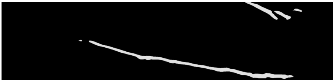
Figure 2. Example of a predicted ghost net mask and its corresponding annotation mask.