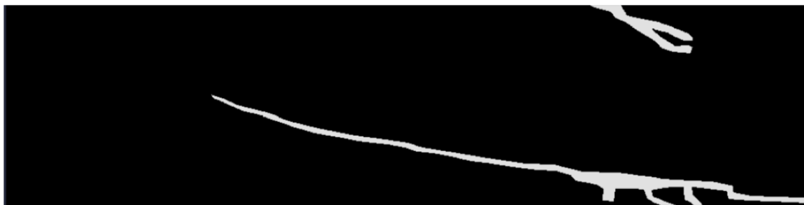
(a) Annotation mask

Additionally, the centroid detection rate accounts for disconnected predictions that represent a single ghost net object. For example, in Figure 2 (b), the three predicted polygons in the top right corner collectively correspond to a single annotated ghost net and are counted as one true positive. This capability is particularly valuable for ghost nets with fragmented or irregular shapes. By aggregating such predictions, the centroid metric provides a more holistic evaluation of detection performance, complementing the limitations of mean IoU and enhancing the model's applicability in real-world efforts.